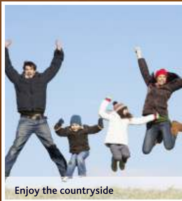
Enjoy the countryside