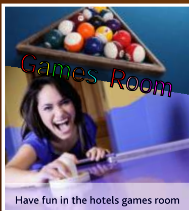
Have fun in the hotels games room